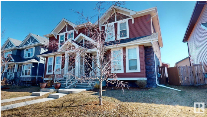
1083 Watt Promenade SW Edmonton